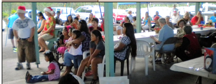
Everyone celebrating at Christmas Party!