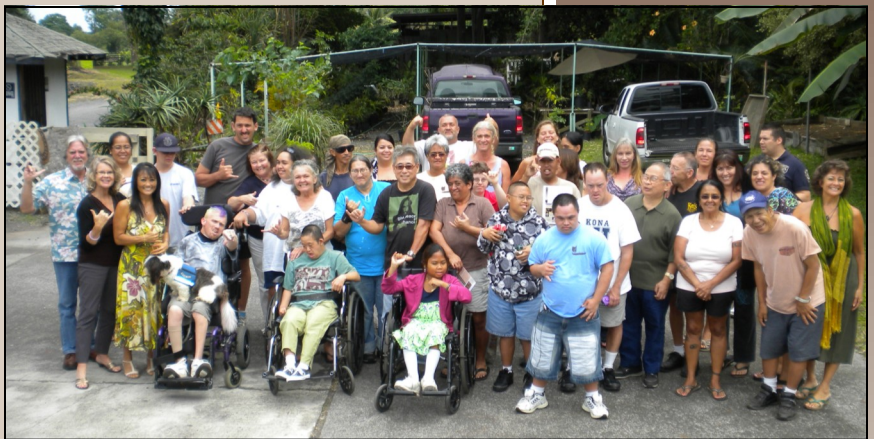
Happy New Year from Everyone at the Arc of Kona!